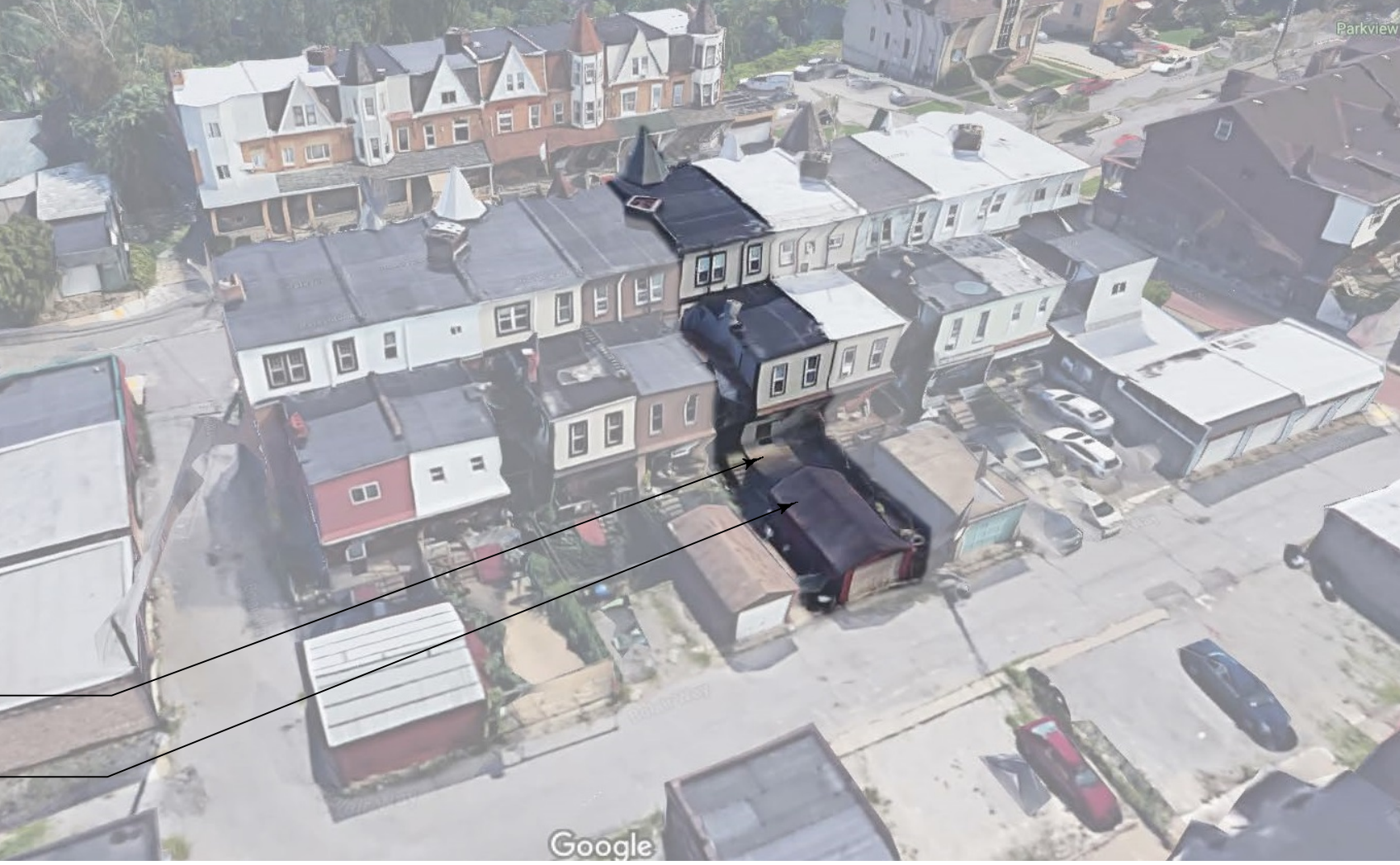
AERIAL VIEW (REAR OF PROPERTY)

VIEWS OF EXISTING PORCH (REAR OF PROPERTY)