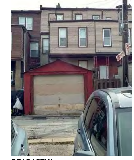
REAR VIEW Showing existing detached garage