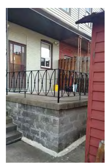
Showing extended porch cons