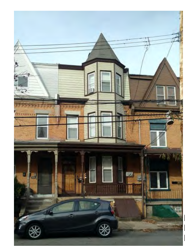
FRONT VIEW No work at Front of Residence

28-M-141 28-M-141 28-M-141 28-M-141 28-M-141 28-M-141 28-M-141 28-M-141 28-M-141