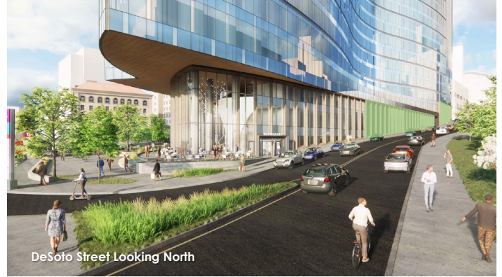
The first three floors will be a dedicated publicly-accessible space: the Lifestyle Village.