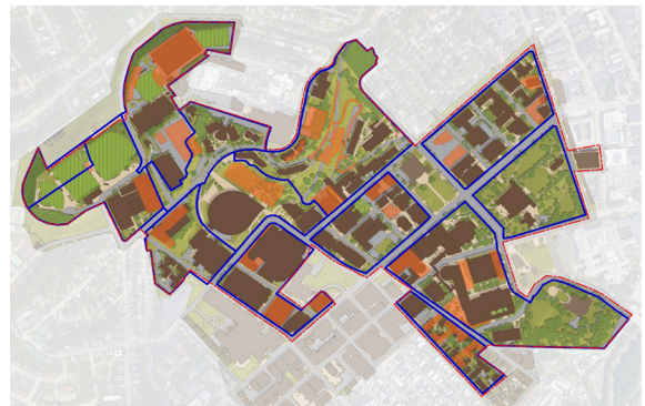
Stormwater master plan map