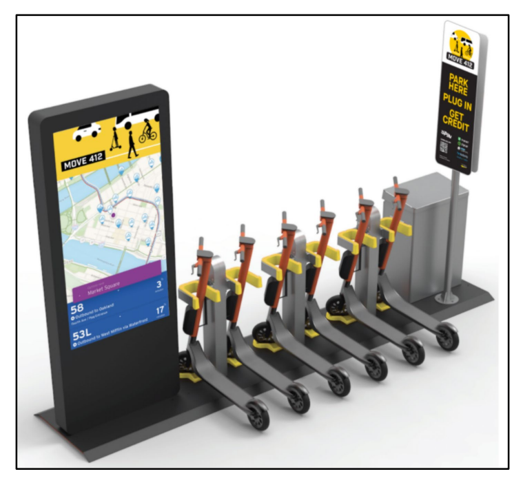
(Move 412 Mobility Hub)

Who? The City's <u>Department of Mobility and Infrastructure</u> and Spin, the micromobility unit of Ford Motor Company, have worked with numerous partners including <u>Port Authority</u>, Duquesne Light, and various neighborhood community groups to determine optimal locations for each hub.