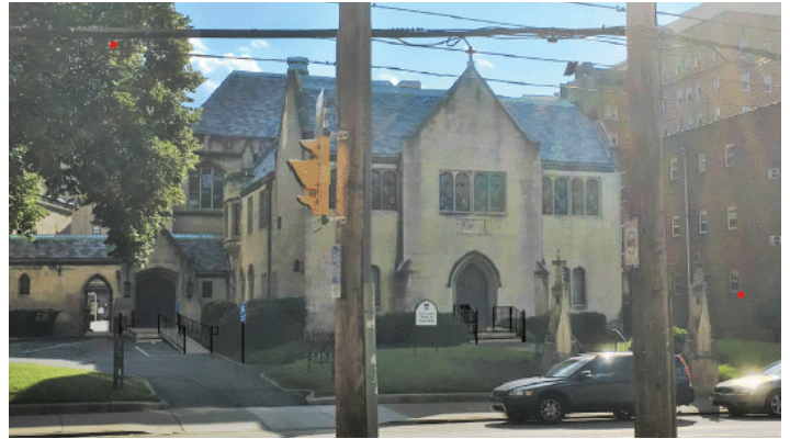
Proposed entry landing and ADA-compliant ramp, view from Park Plaza driveway

The project is part of a larger scope of work that includes renovating the interior of the building.